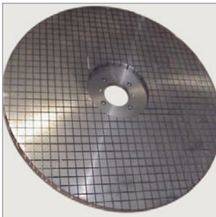
Cross hatched ductile iron

From concept to delivery, Stähli USA provides the most efficient turn around time and guaranteed performance.