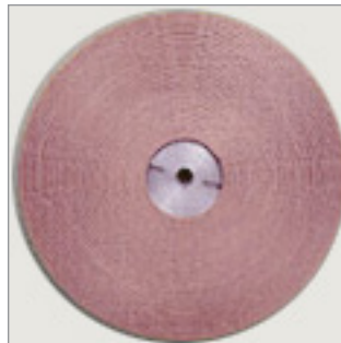
Copper hard polish plate